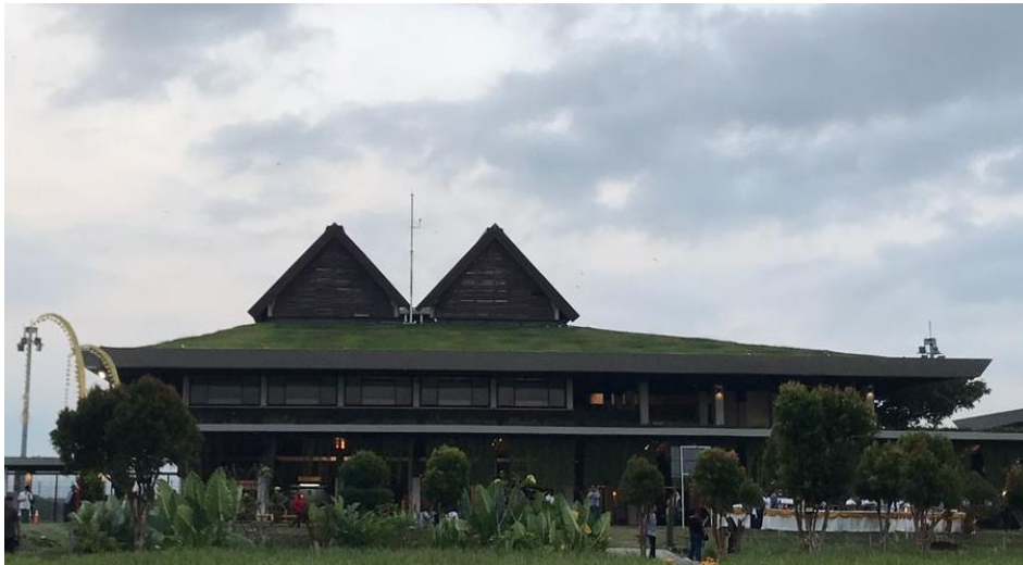
Figur 2. Blimbingsari Banyuwangi International Airport

A notable local innovation is Banyuwangi Regency Regulation No. 1 of 2022, which mandates the implementation of green building principles within municipal governance. Its practical application can be observed in the Banyuwangi International Airport (Figure 2), a landmark project that achieved GreenShip Gold Certification. In this case, the regulatory framework functions as an enabling mechanism, while the GreenShip Rating System provides the technical assessment criteria. The airport demonstrates the integration of key green building aspects, including passive cooling strategies, natural ventilation, daylight optimization, and the use of locally sourced materials. These features align with both GreenShip criteria and the performance-oriented principles outlined in the Banyuwangi regulation, particularly in terms of energy efficiency, resource conservation, and climate-responsive design (Dharmatanna, 2023; Dharmatanna & Hidayatun, 2021). Empirical studies further indicate that the implementation of such strategies significantly enhances user comfort, contributing up to 66.6% of perceived environmental quality (Cahyaningrum & Yudianto, 2023). In addition, the incorporation of renewable energy systems, natural lighting, cross ventilation, and water reuse strategies reflects alignment with core GreenShip categories such as energy efficiency, water conservation, and indoor environmental quality (Rossa et al., 2023; Aprilian & Rizaldi, 2023).